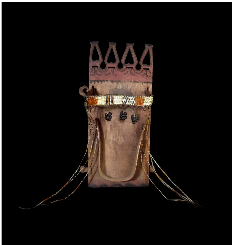
Figure 4 “cradle” (AM 2003,19.42), Anishinaabe artist, Great Lakes, pre-1825