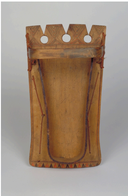
Figure 3 "cradleboard", likely Anishinabe artist, Great Lakes c. 1790 (National Museum of the American Indian, Smithsonian Institution [NMAI 24/2019].)