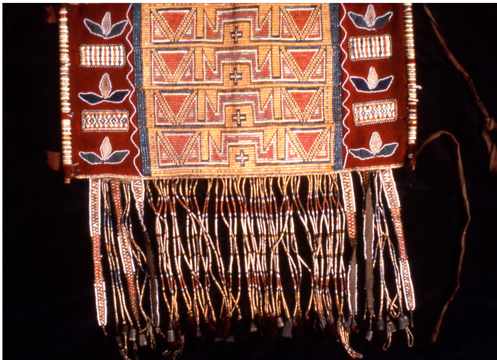
Figure 10 “cradleboard decoration”, Anishinaabe (Ojibwe), Red River, c.1822 (Image © The Manitoba Museum, Winnipeg, MB, HBC 47-6)