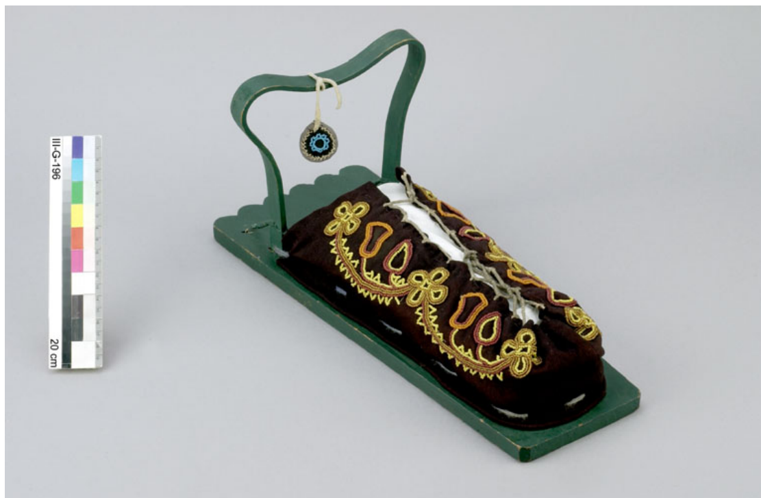
Figure 1 “cradleboard”, Teme-Augama Anishinabai artist, Bear Island, n’Daki Menan, c. 1913 (Canadian Museum of Civilization, artifact III-G-196, D2003-10374)