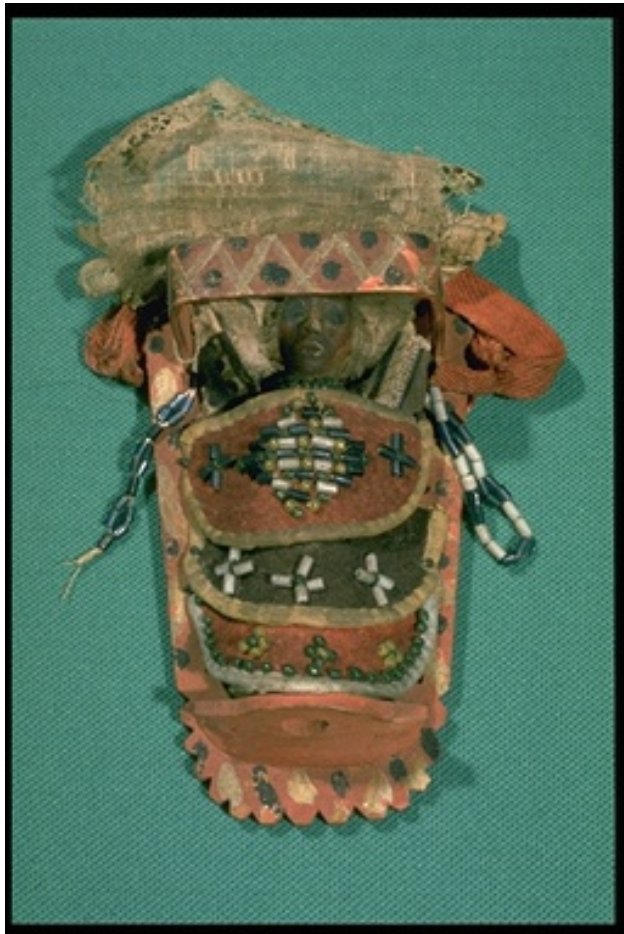
Figure 9 “doll”, Anishinaabe (Algonquin) artist, Northeastern Woodlands, c. 1779 (Canadian Museum of Civilization, artifact III-L-276, S75-501)