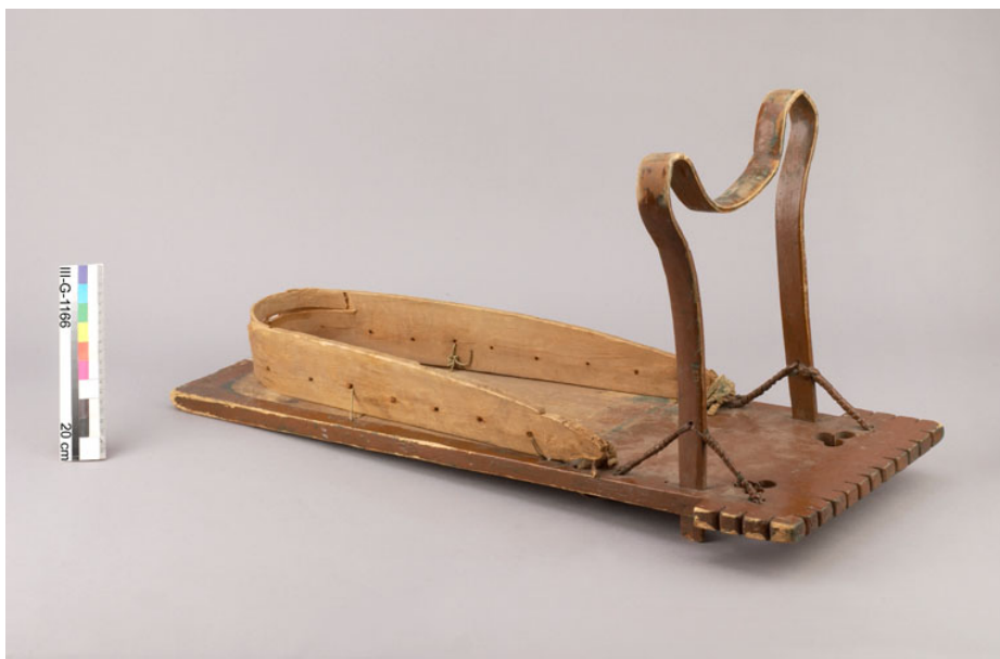
Figure 5 “cradle-board” Anishinaabe (Ojibwe) artist, Pic Mobert, c. 1940, (Canadian Museum of Civilization, artifact III-G-1166, D2003-10076)