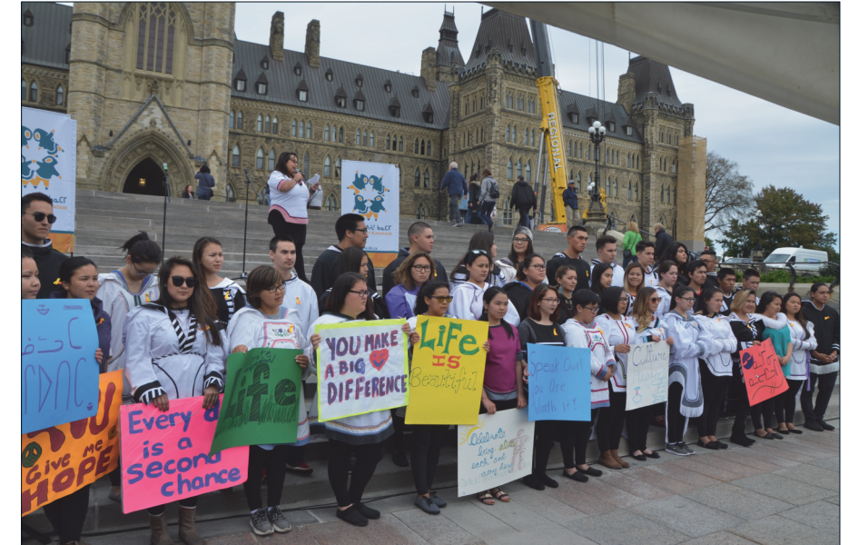
Participants at the Celebrate Life event at Parliament Hill on September 10, 2018

Canada doesn't track suicides specifically by Indigenous identity (2) ,