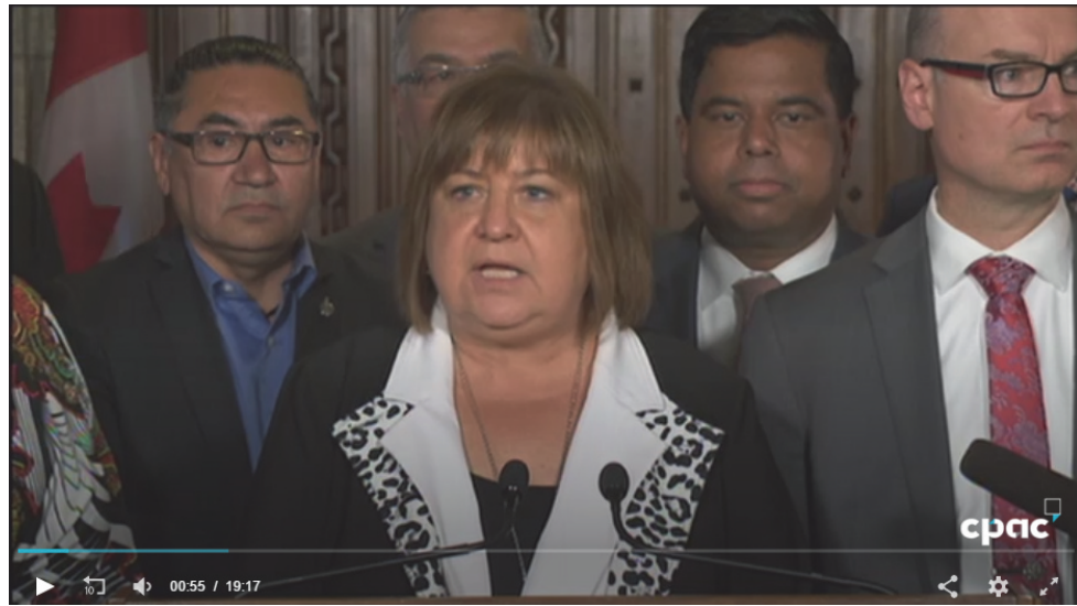
Indigenous and Northern Affairs (INAN) parliamentary committee on June 19, 2017 (11) releasing their report, "Suicide Among Indigenous Peoples and Communities" (12)

The need for repair, to create equitable conditions and treatment, was also recognized recently when the Canadian government was ordered (8) by the Canadian Human Rights Tribunal to pay $40,000 each to all individual First Nations children and some parents/grandparents who were affected by the government's discriminatory practices in child welfare and service provision, including in the area of suicide-prevention services, as part of an ongoing tribunal case to end discriminatory policies.