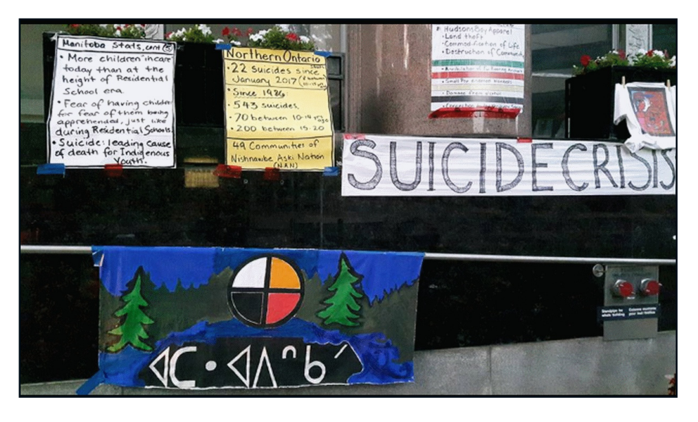
#NOMIC Ground Zero occupaton camped outside INAC Toronto from July to December 2017: #NotOneMoreIndigenousChild.

The available statistics on Indigenous suicide in Canada do not tell the full story. The best currently available data is dated or not comprehensive, and there are issues