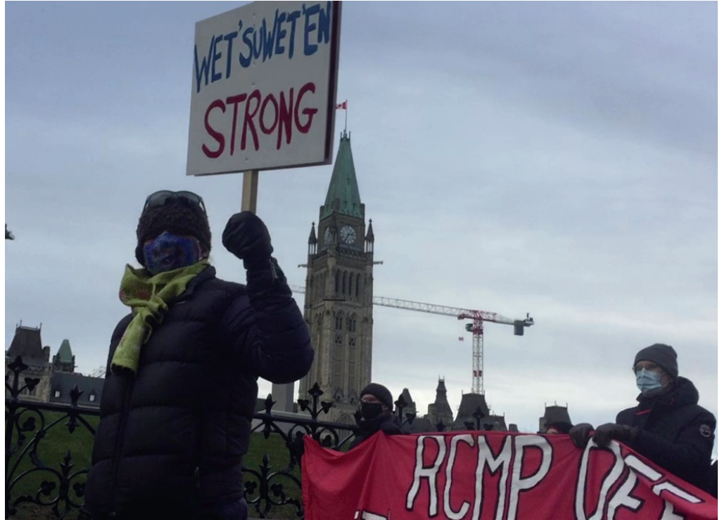
Rally supporting Wet'suwet'en land defenders after 2021 RCMP raid: youtu.be/L8vMTt-c5X8

— Arthur Manuel, 2009 interview for Indigenous Sovereignty Week